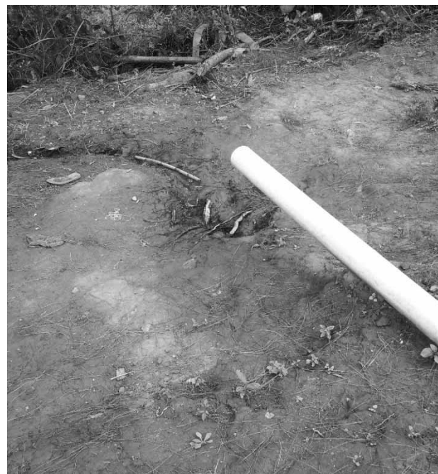
Figure 1 | Wastewater outlet and drainage from a water point, Chikwina-Mpamba.

Respondents' willingness to reuse greywater depended greatly on both the type of greywater and the reuse