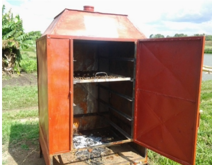
Figure 2: The modified fish smoking kiln

The smoking chamber held 5 tiers of trays made from mild steel (1.2mm) with 4 legs to raise it from the ground for free circulation of air during smoking and to allow it be stable when in use.