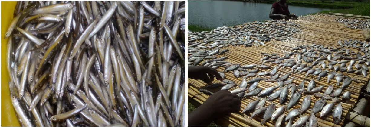
Figure 4: Fresh Engraulicypris sardella (left) and Copadichromis species (right)

study site, they were weighed and semidried for about five minutes under the temperature of 25°C.