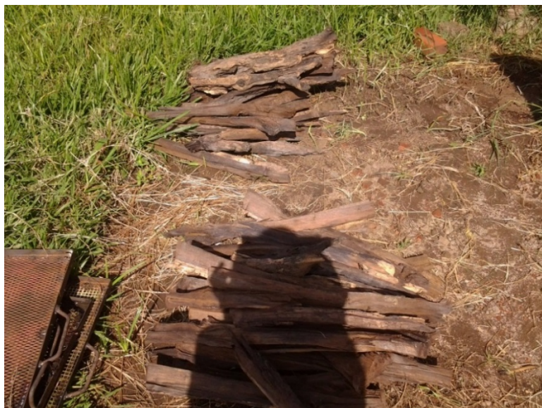
Figure 5: Dry hardwood from Pericopsis angolensis tree used for smoking of the fish

Dry hardwood from Pericopsis angolensis tree (locally known as Muwanga) was used for frying and smoking of the fish in this study (Figure 5).