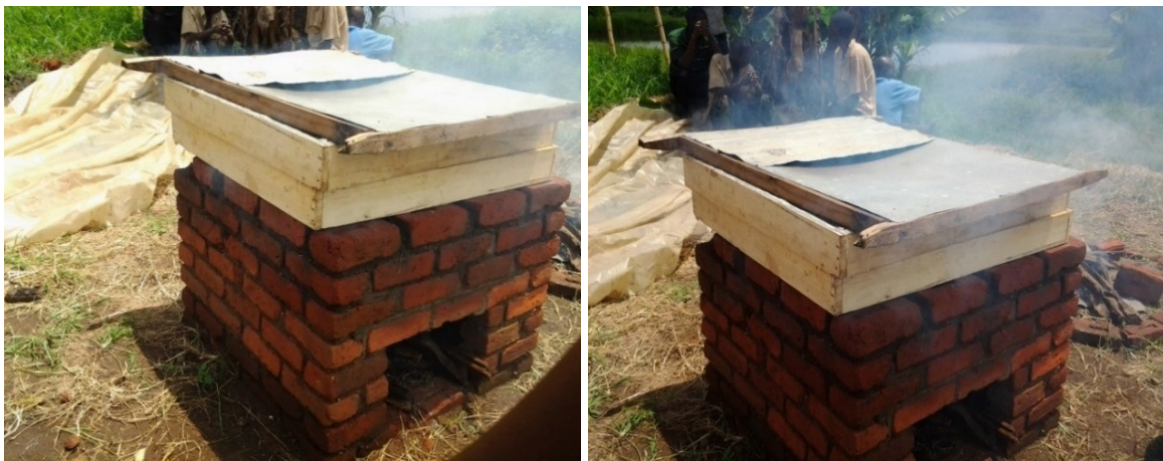
Figure 3: The traditional smoking kiln

The traditional kiln (Figure 3) was made of burnt mud bricks and mud. A separate plywood cover coated with iron sheet (0.55mm) on its outer bottom part was used as a cover for the fish smoking trays to cover the fish during smoking. The smoking trays were made of plywood as well and mesh wire as its base. The dimensions of the kiln as shown in Figure 3 were: 90.5 cm long and 90.5 cm wide, fire hole: 29cm by 26 cm.