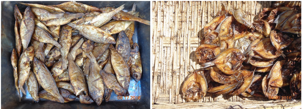
Figure 8: Copadichromis species smoked using the FRISMO kiln (left) and frying (right) method

Qualitative descriptive analysis (QDA) of the organoleptic properties for the processed fish products was used for assessment on a nine-point hedonic scale summarized as follows: 1 - dislike extremely, 2 - dislike very much, 3 - dislike, 4 - dislike slightly 5 - neither like nor dislike, 6 - like slightly, 7 - like, 8 - like very much, 9-like extremely [13].