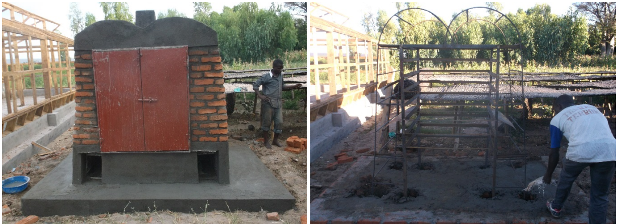
Figure 1: Completed FRISMO kiln (left) and the inside metal framework (right)

Seven racks were made within the smoking chamber where trays are placed during smoking. The smoking trays were 0.9 x 0.9 m and two kilns were constructed for the study.