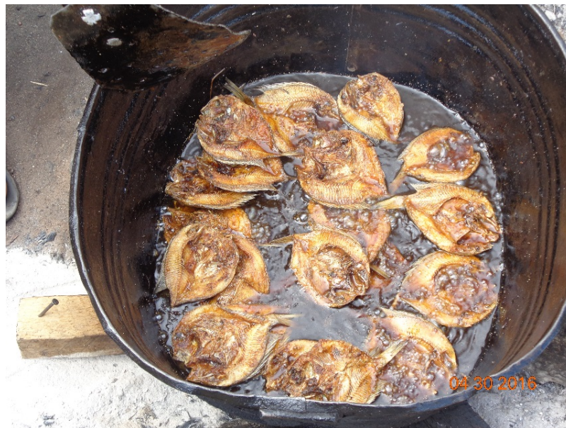
Figure 6: Fish frying