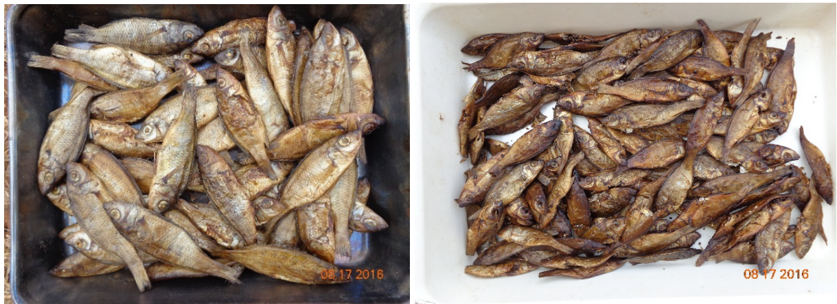
Figure 7: Copadichromis species smoked in the modified kiln (left) and Traditional kiln (right)

Organoleptic tests for fish smoked (Figures 7 and 8) were carried out using a group of 40 pre-trained assessors, 50% of which were male and the other 50% were female. The team also combined University students, workers as well as relatives to the university workers.